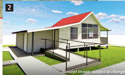
Rear view of Block A with DDA-compliant ramp