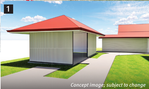
Refurbished play shed and new turfed area