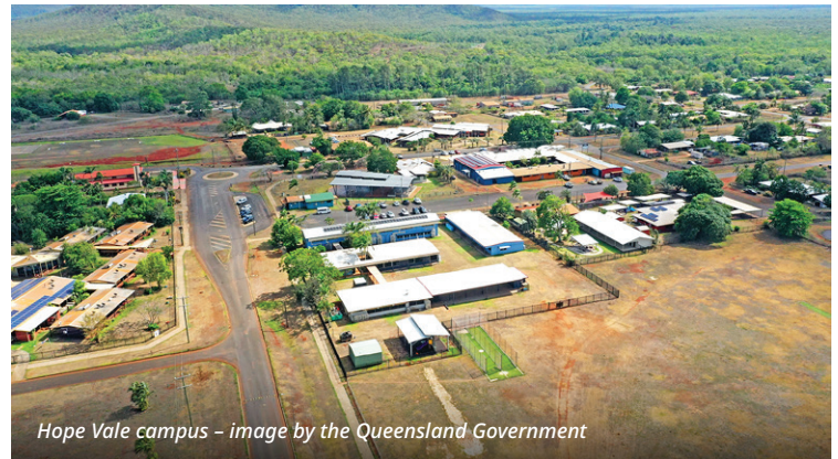
Hope Vale campus