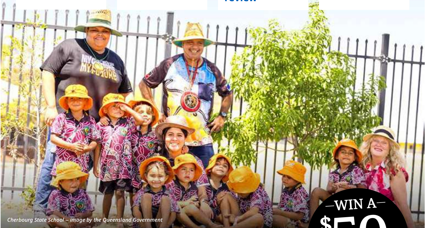
Cherbourg State School