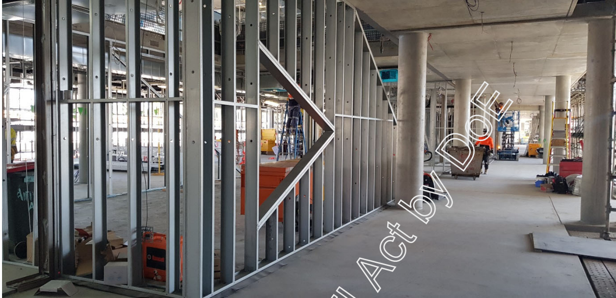
Figure 1 D Level 4 Framing and rough ins

(please include detailed caption in order to demonstrate the progress on site)