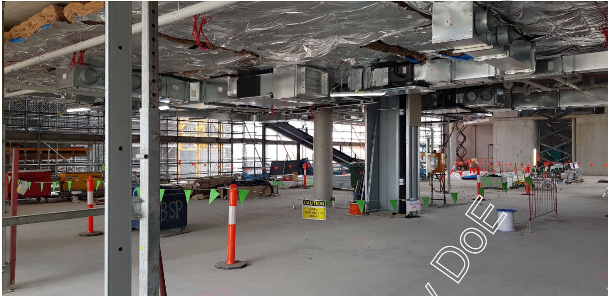
Figure 7 Building C level 4 fitout ongoing