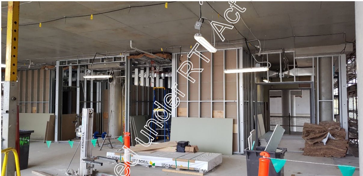
Figure 8 Building C Level 5 fitout ongoing