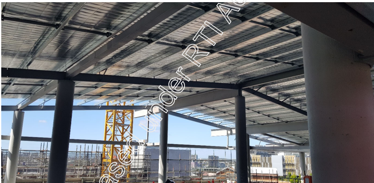
Figure 10 Building C Level 7 roofing ongoing