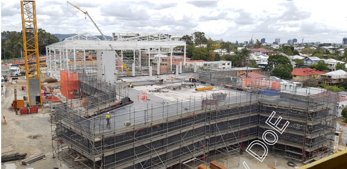
Figure 13 Building E Level 4 Deck forming