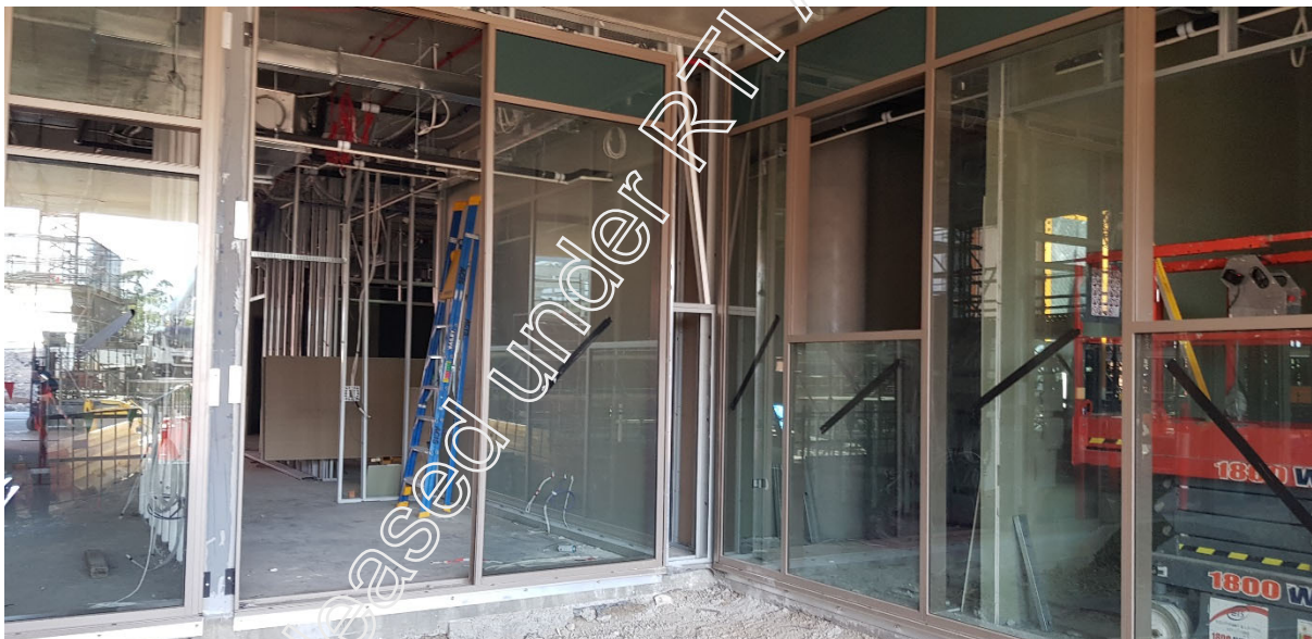
Figure 6 Building C Level 3 Fit out ongoing, glazing ongoing