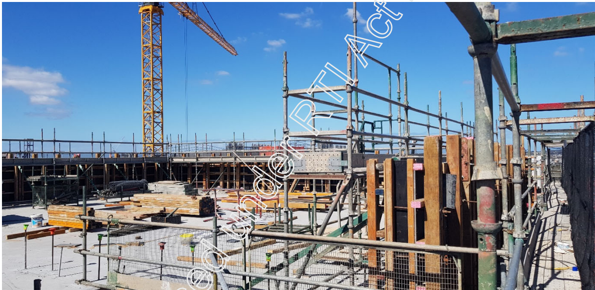
Figure 4 Building D Level 8 walls poured