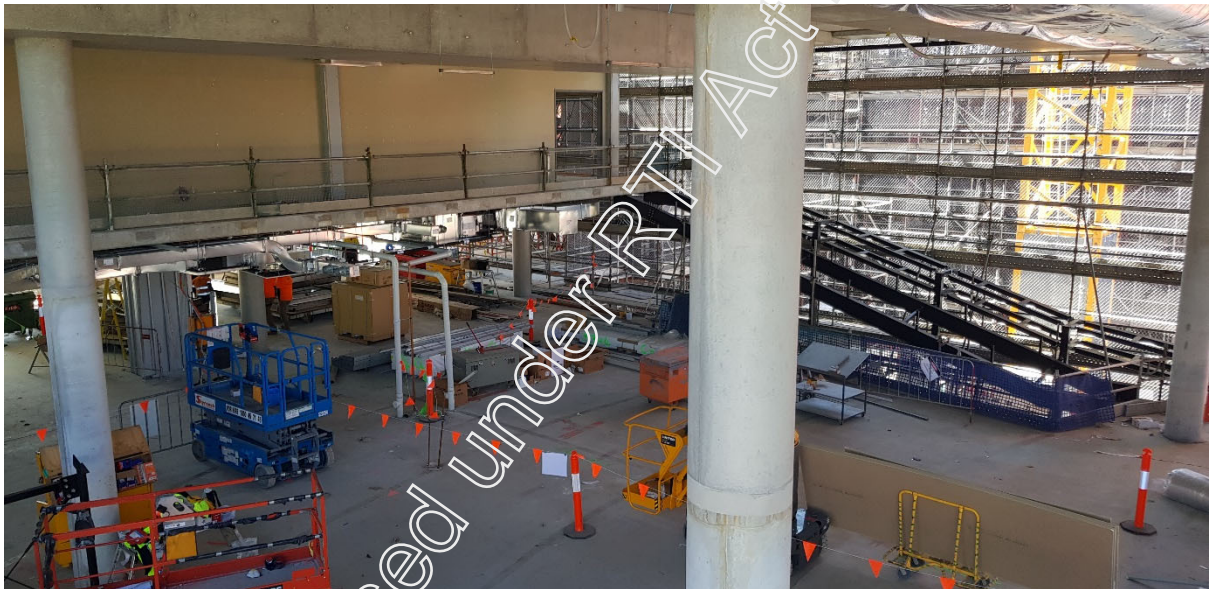
Figure 8 Building C Level 5 fitout ongoing