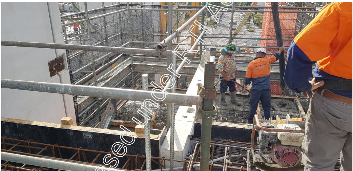
Figure 4 Building C Level Stairs pouring