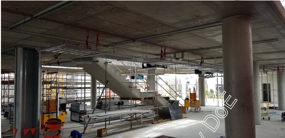
Figure 9 Building C Level 6 framing and roughins