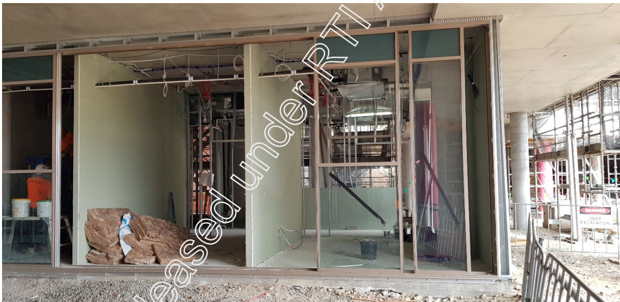
Figure 6 Building C Level 3 Fit out ongoing, glazing commenced