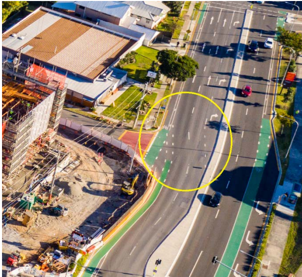
Photo: road intersection between Annerley Road and Grantham Street, Dutton Park.