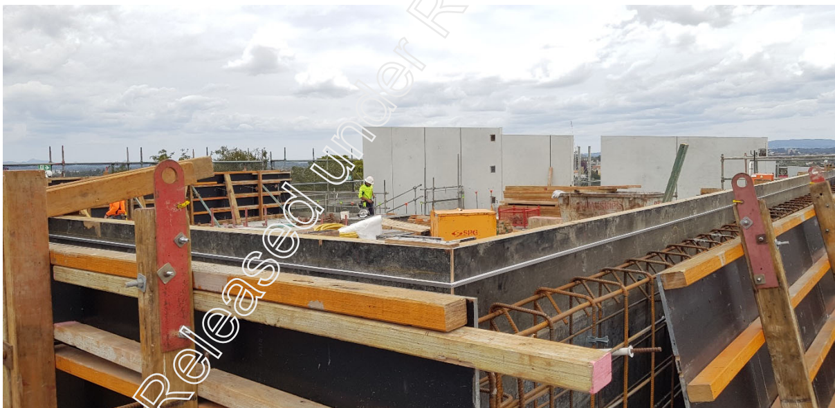
Figure 2 D 8 Deck poured, forming walls