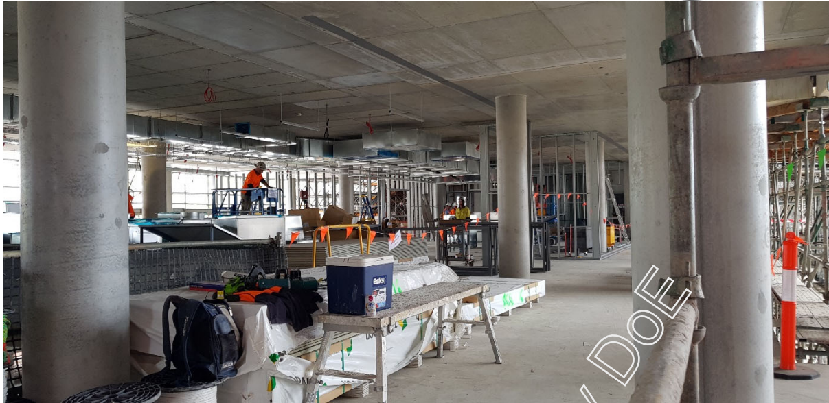
Figure 5 Building D Level 5 framing and rough ins on going