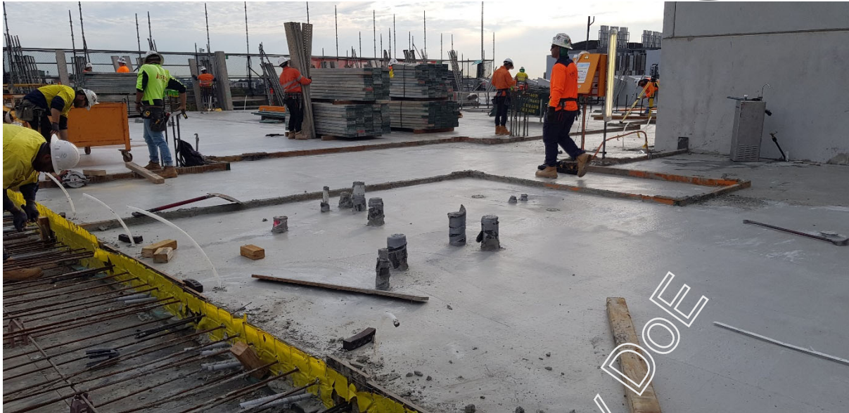
Figure 5 Building B Level 6 Pour 1 poured