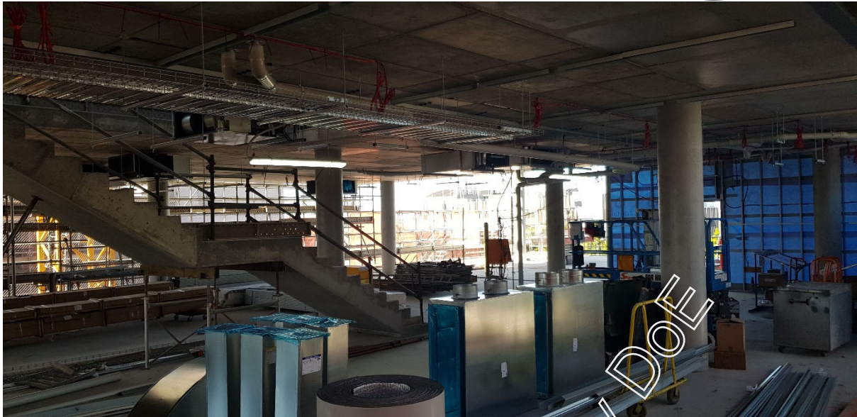
Figure 9 Building C Level 6 framing and roughins