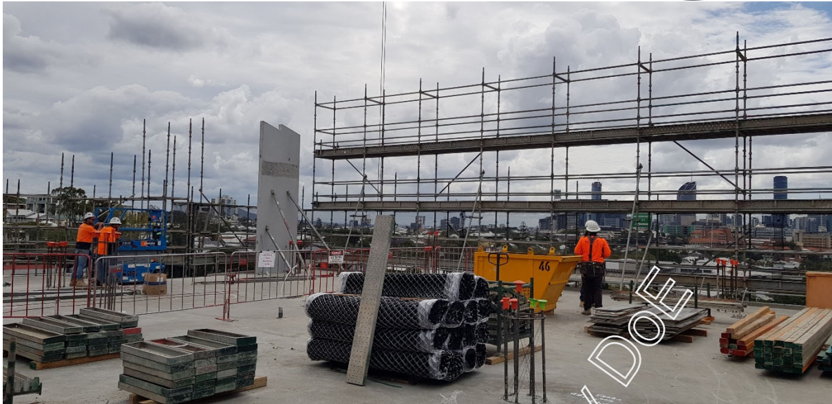
Figure 11 Building B Level 6 poured, feature precast installed