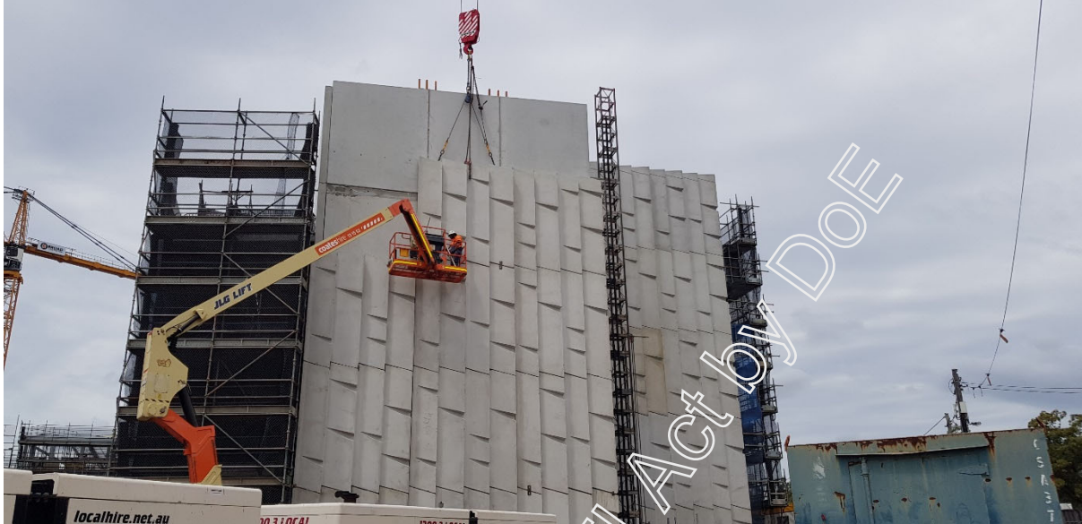
Figure 1 D Senior Feature Precast in progress

(please include detailed caption in order to demonstrate the progress on site)