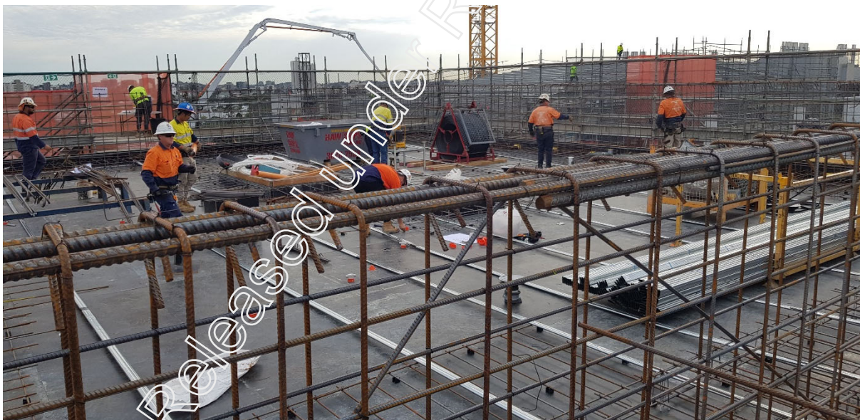
Figure 2 D 8 Deck & Walls forming