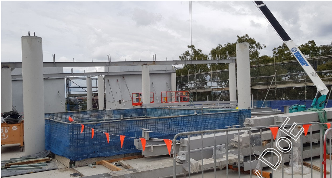
Figure 3 Building D Structural steel ongoing