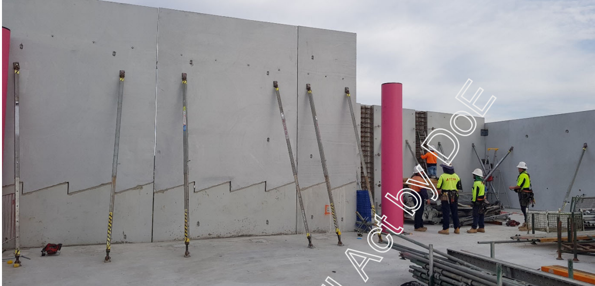
Figure 1 D 7 Precast complete

(please include detailed caption in order to demonstrate the progress on site)