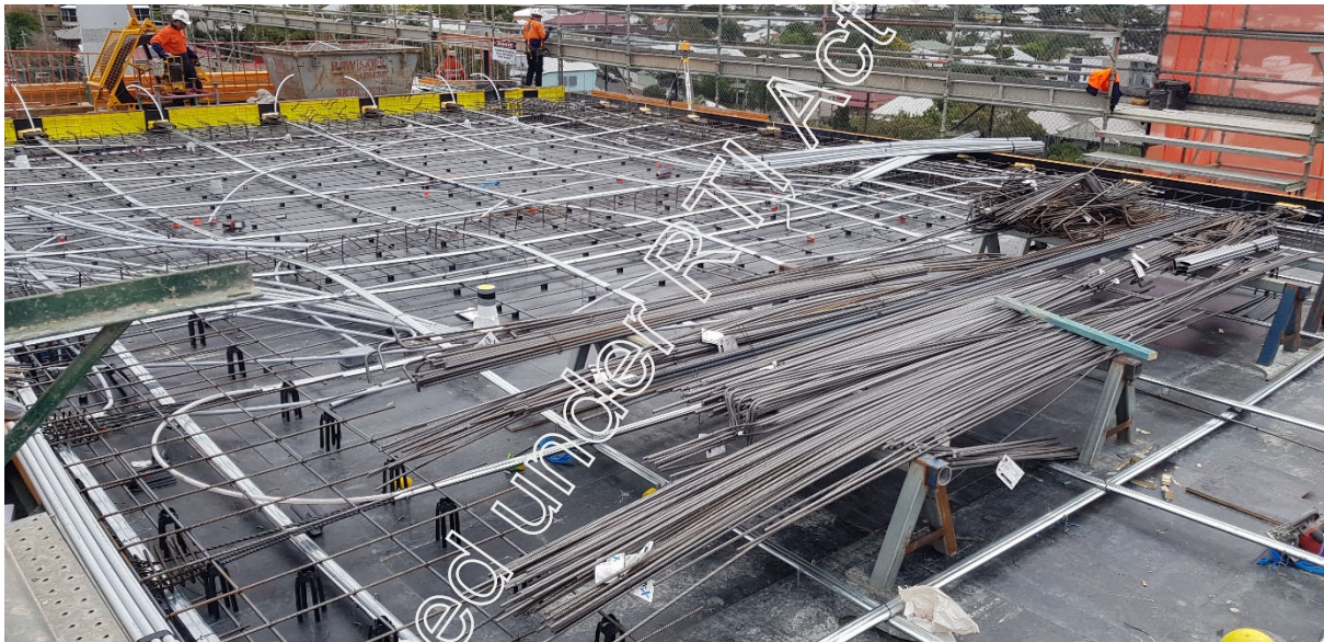
Figure 12 Building B Level 7 Pour 1 prep ongoing