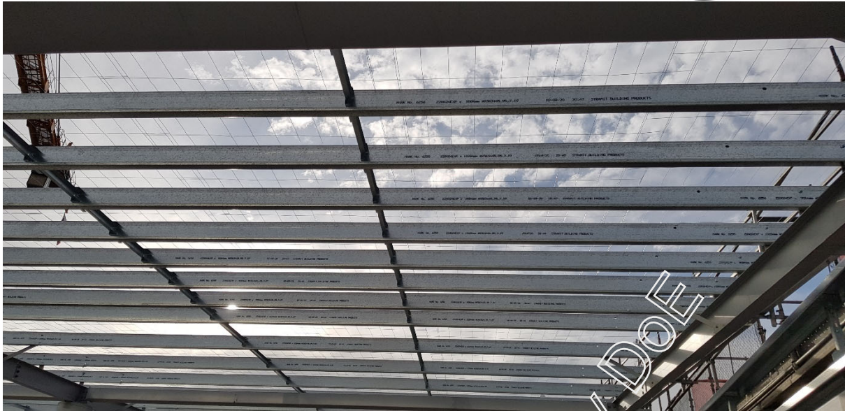
Figure 3 Building C Structural Steel ongoing, roof safety mesh installed