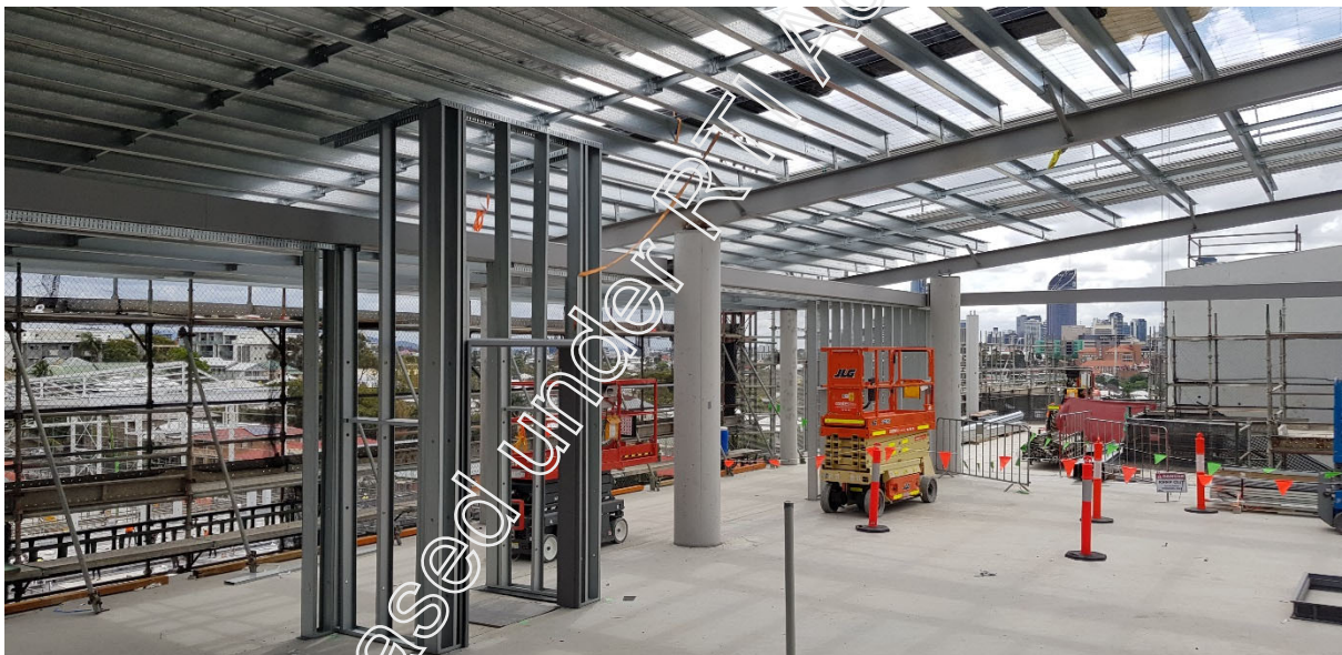
Figure 10 Building C Level 7 Framing and rough ins commenced