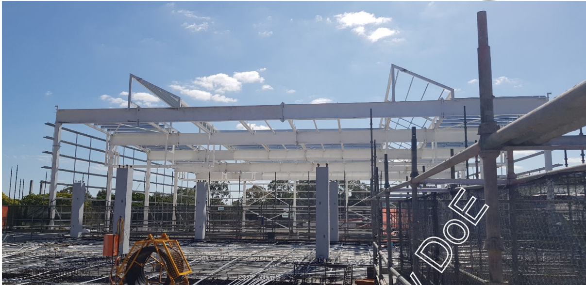
Figure 13 Building E structural steel ongoing