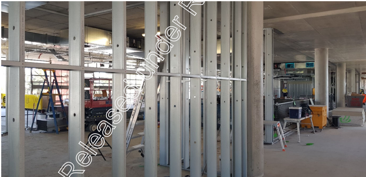
Figure 2 D Level 5 Framing and rough ins