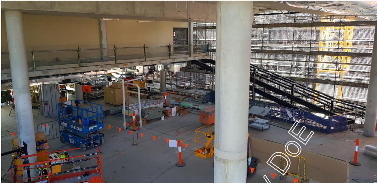
Figure 7 Building C level 4&5 partitions in, framing and rough ins ongoing.