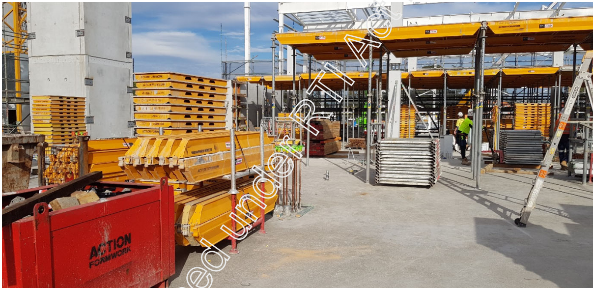
Figure 6 Building E Level 3 pour 5 poured 21/09