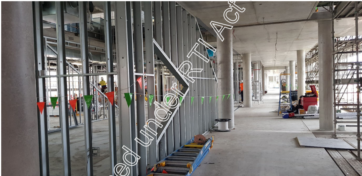
Figure 4 Building D Level 4 framing & roughins ongoing