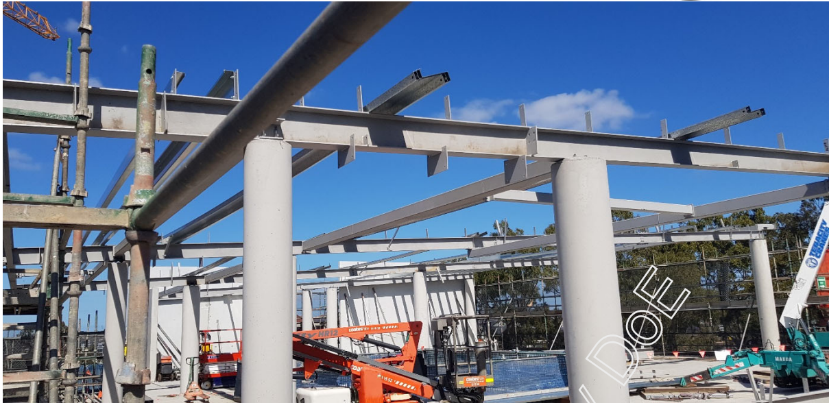
Figure 3 Building D Structural steel & roofing ongoing