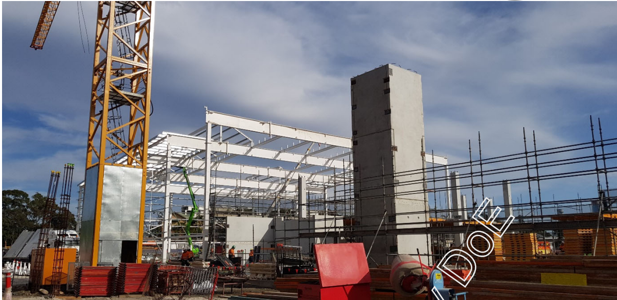
Figure 7 Building E Structural steel on going, precast lift installed