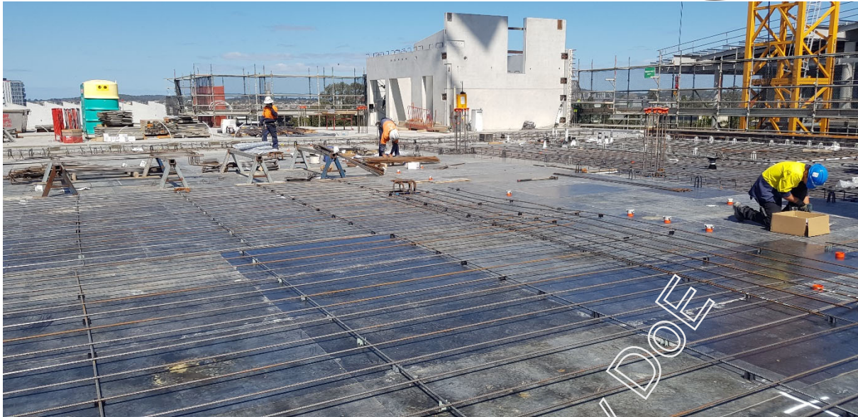
Figure 11 Building B Level 7 being formed