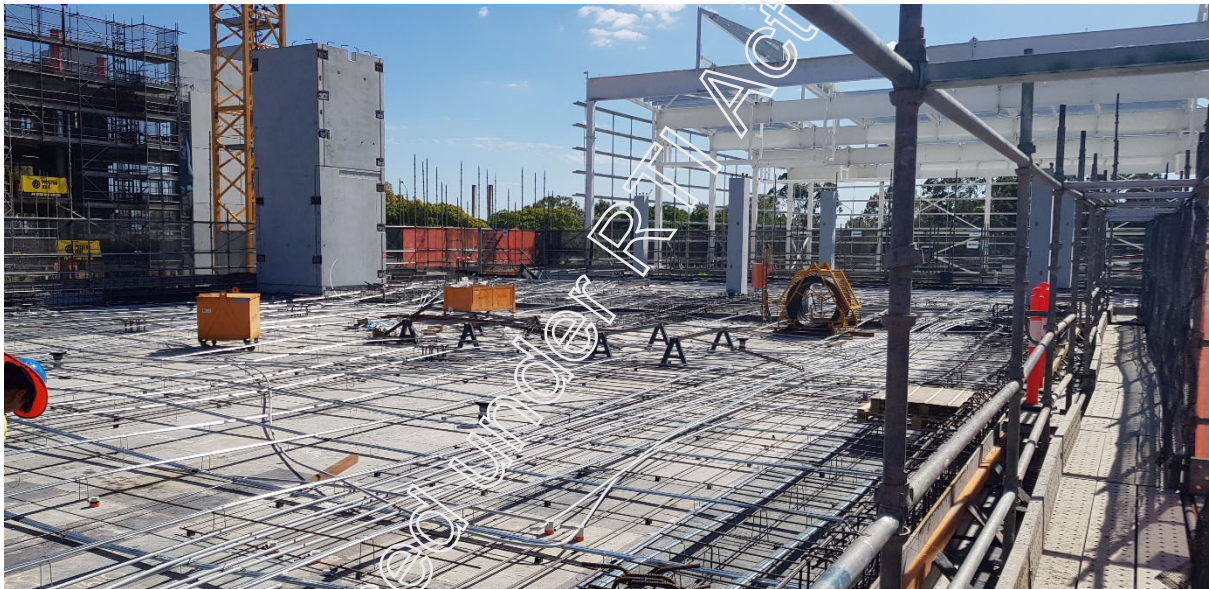
Figure 12 Building E Level 4 Deck in progress